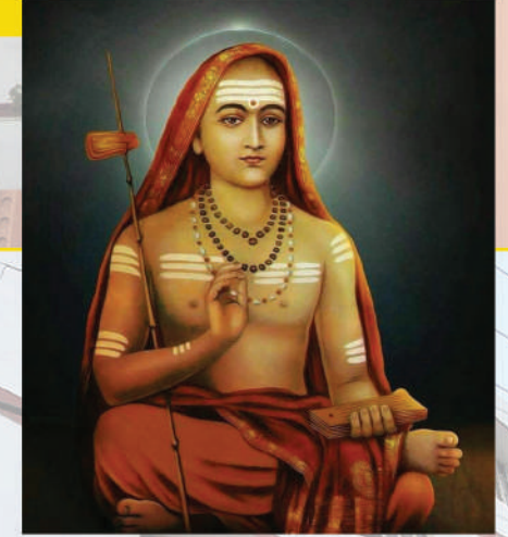
Our Inspiration His Holiness Jagatguru Adī Sankarāchārya